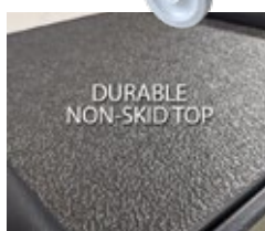
DURABLE NON-SKID TOP