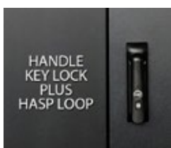
HANDLE KEY LOCK PLUS HASP LOOP