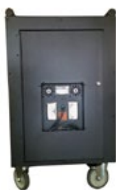
LOCKING REAR DOOR WITH CORD STORAGE