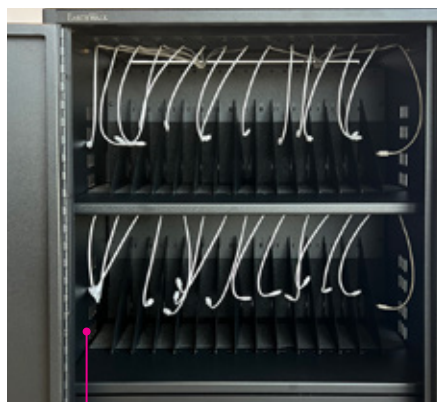
Vertical storage of devices with removable, easy-to-configure rubber-coated dividers