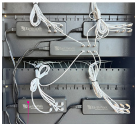
Integrated HE-PD system w/ pre-wired USB-C charging cables