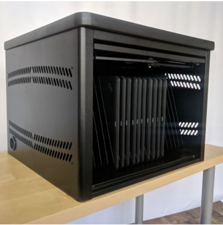
Stock color is black; available in other colors